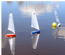
Three sailing around a mark