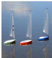
Three Pool Sharks