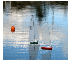
Pool Shark "surrounding" a V12A

This Pool Shark Footy won the 2010 AMYA National Footy Class Regatta as well as the 2012 AMYA Region 6 Footy Class Regatta. A VERY FAST BOAT INDEED!!!