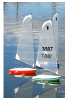
Three's a crowd