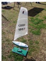
On a Stand