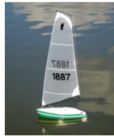
In the water